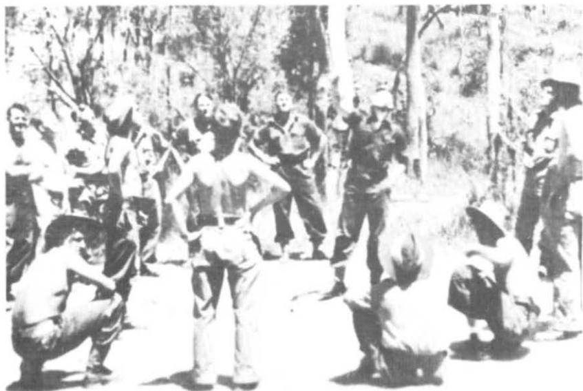
Another form of recreation needs no explanation. Members of "A" and HQ Coys pass the time while not on duty.