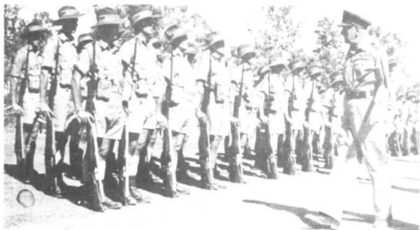
The Governor General (Lord Gowrie) inspects members of "D" Coy on the battalion parade in honour of the official opening of the £20,000 Canteen at the 39 Mile.