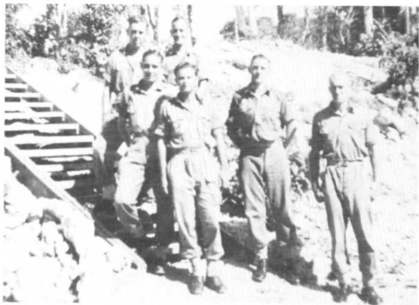
Above and Below: On and Off parade whilst on Stirling Island.