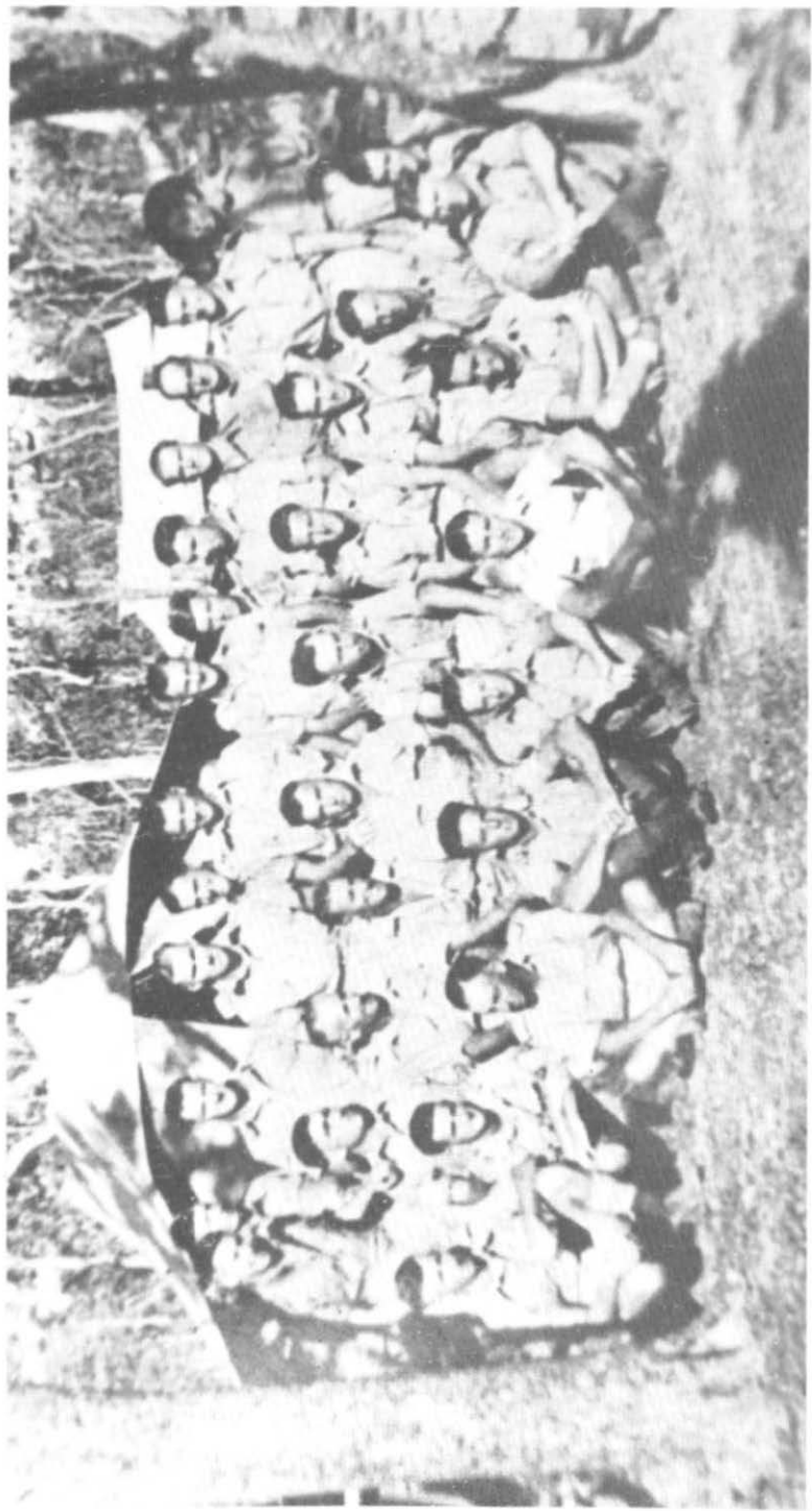
The Mortar Platoon, dressed in their "Sunday Best" pose for the camera at the 39 Mile in Northern Territory, just prior to returning South for leave.