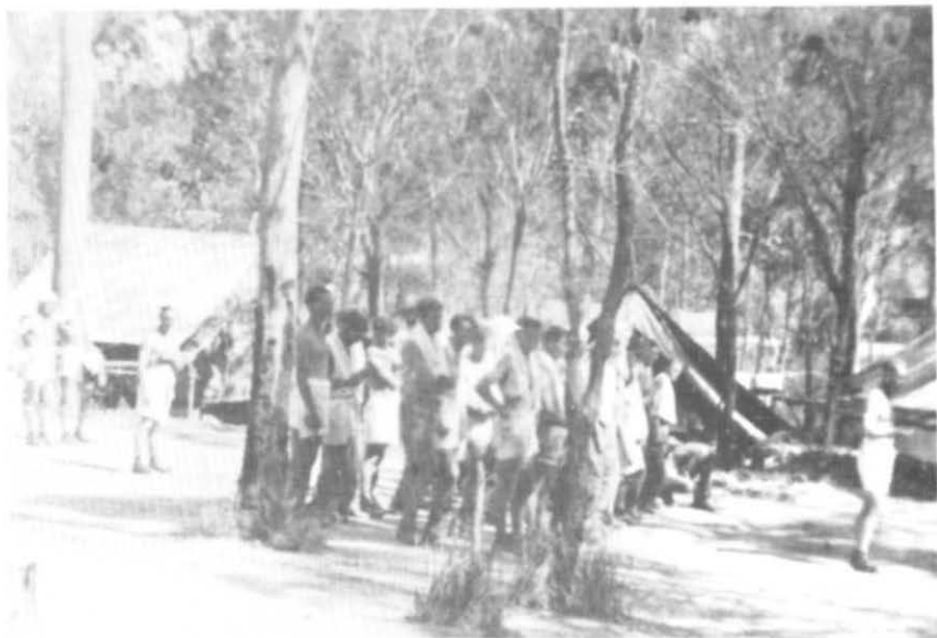
Typical of the entire area occupied by the 7th Bn on the Tablelands is this one depicting members of "B" Coy mustering for a swimming parade.