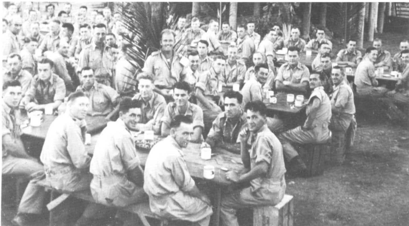
Another of the photographs that make up the entire members of "HQ" Coy, at a formal dinner, when billeted in the empty houses of the Fortress area of Darwin in 1943.