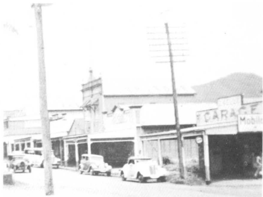
Some of the lucky ones were granted three days leave in Cairns. This is how the town looked in 1944.