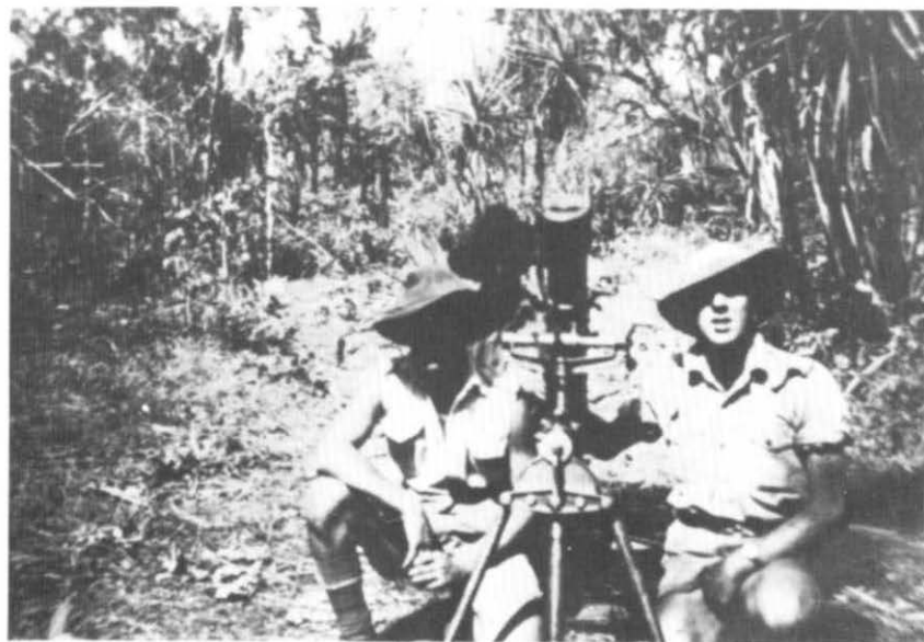
No. 1 Mortar (without sights) with the Nos 1, 2 and 3, post for the camera. This detachment represented to Battalion on a number of Brigade and Divisional Sports meeting and was detach to every Company of the Battalion during its existence.