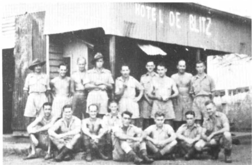
The "Q" Store Staff in Darwin.