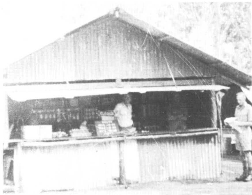
The place to purchase razor blades, soap or tooth paste, etc.