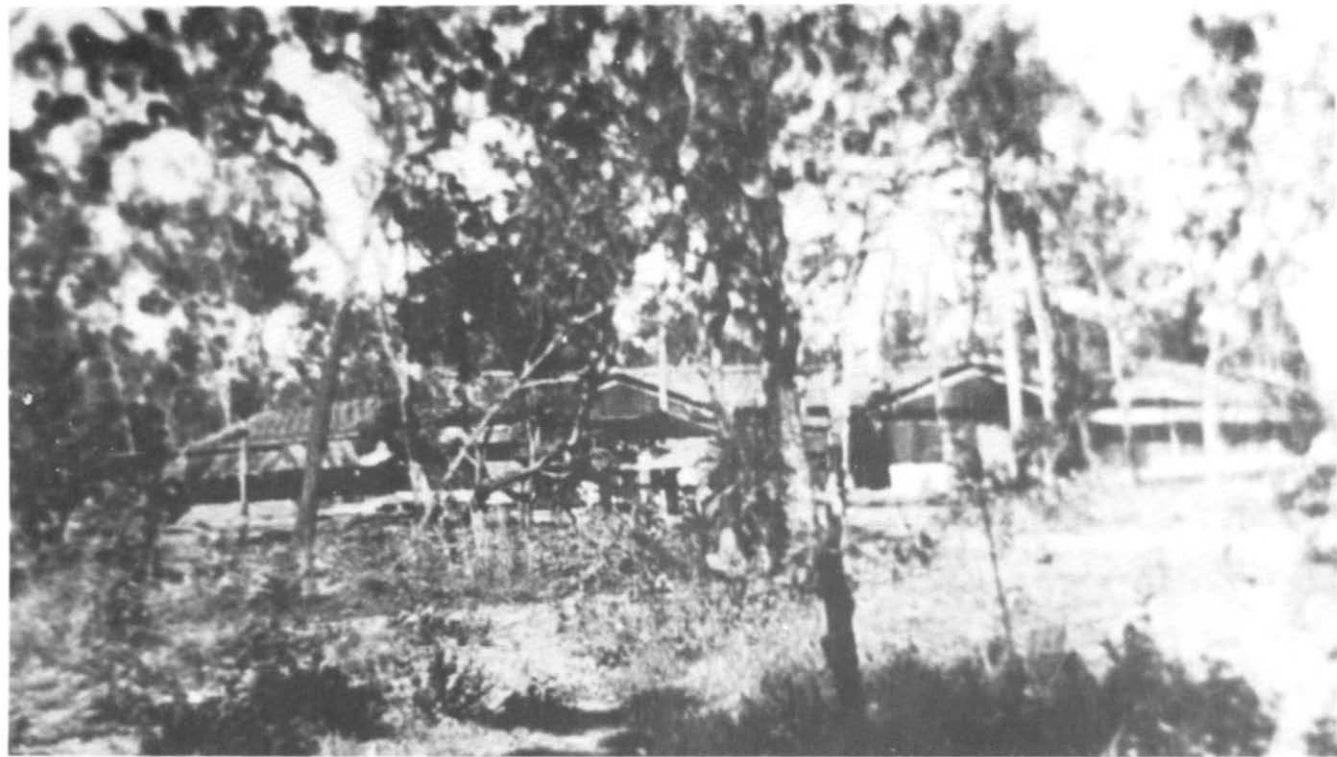
The £20,000 canteen, built for the troops at the 39 mile and opened by Lord Gowrie in August, 1943. A very modern complex containing everything the troops could desire. Unfortunately, 18 months too late for members of the 7th Battalion to appreciate to the fullest. The Battalion moved out of the area soon after the opening.